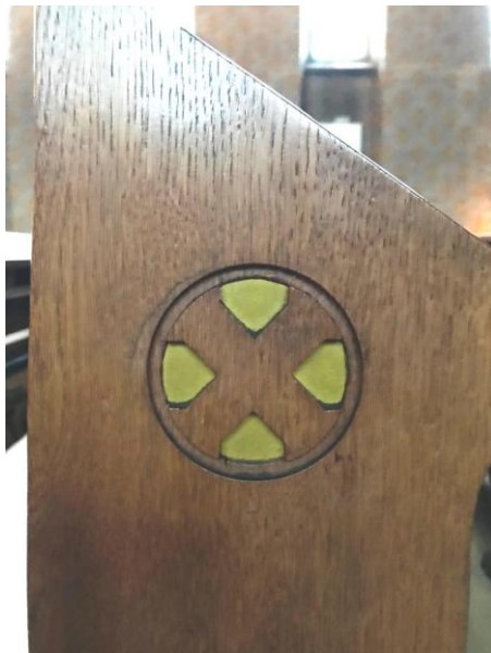
Church secret – a pew-end